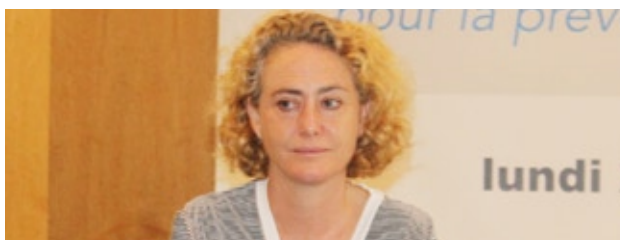
Dagmar Schmidt, Amb. Switzerland to Senegal

«Prevention requires that we work on the causes of violence, not just the symptoms. This often involves a paradigm and attitude shift – and more specifically it involves a willingness to accept plural societies and diverse identities, and to recognize the value of tolerance and dialogue.»