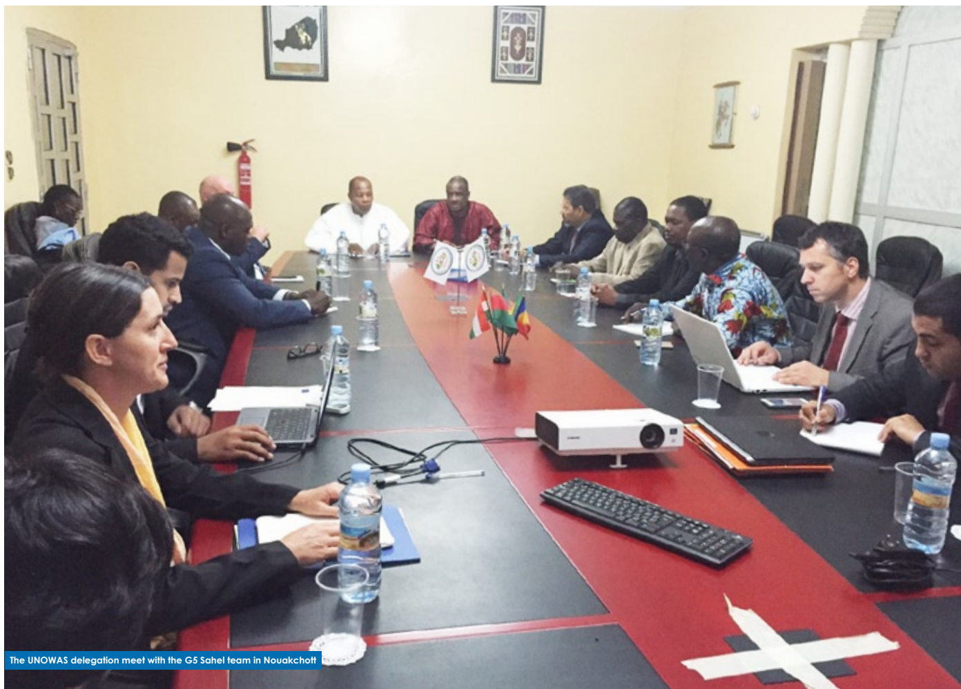
The UNOWAS delegation meet with the G5 Sahel team in Nouakchott

The newly established UNOWAS Liaison Cell in Nouakchott will help reinforce an enhanced collaboration and partnership between the UN and the G5 Sahel.