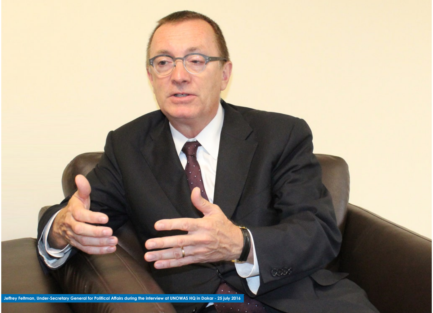
Jeffrey Feltman, Under-Secretary General for Political Affairs during the interview at UNOWAS HQ in Dakar - 25 July 2016

At the conclusion of his tour in Central and West Africa regions on 25 July, Mr. Jeffery Feltman, United Nations' Under-Secretary-General for Political Affairs spoke to UNOWAS E-Magazine in Dakar about the objectives of his visit and the role of UNOWAS in the region. Interview.