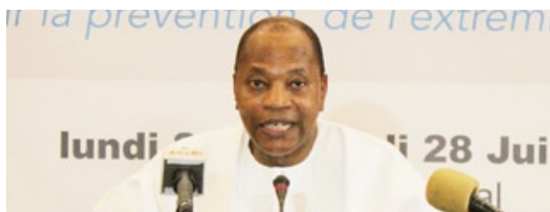
Mohamed Ibn Chambas: SRSg UNOWAS

«Over the past decade, efforts to prevent violent extremism were primarily designed as a complement to anti-terrorist operations. They often mainly resulted in short-term security measures aimed at containing the immediate consequences of violent acts and preventing their recurrence.»