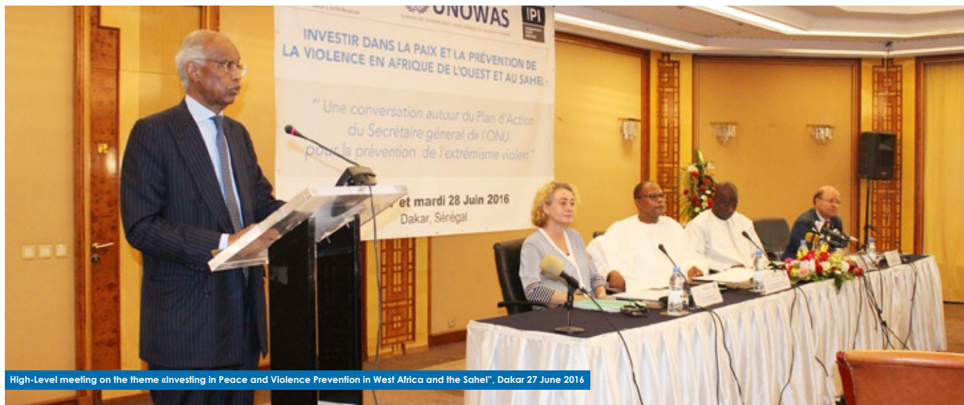
High-Level meeting on the theme «Investing in Peace and Violence Prevention in West Africa and the Sahel», Dakar 27 June 2016

A high-level meeting on the theme: «Investing in Peace and Violence Prevention in West Africa and the Sahel» was held in Dakar on 27 and 28 June 2016 to identify effective measures to prevent violence, including violent extremism and to explore innovative approaches to invest more in peace in West Africa and the Sahel.