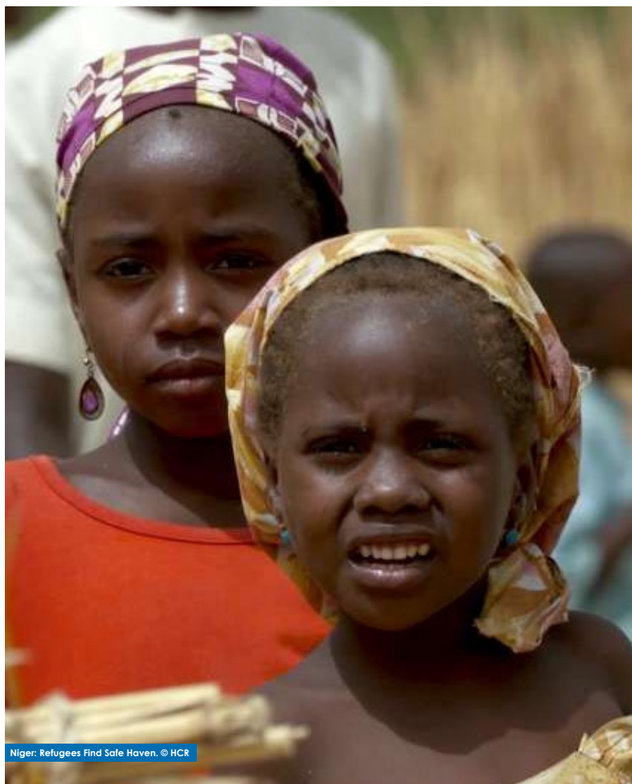
Niger: Refugees Find Safe Haven.

don't know how I am still alive. I was completely overwhelmed by what was happening around me. There were dead bodies of men, women, children around me. I spent the night without eating, without drinking. The insurgents who had remained by the river were finishing the survivors."