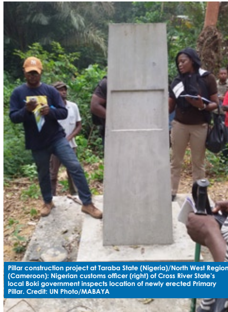
Pillar construction project at Taraba State (Nigeria)/North West Region (Cameroon): Nigerian customs officer (right) of Cross River State's local Boki government inspects location of newly erected Primary Pillar.

Under the leadership of the Chair of the Cameroon-Nigeria Mixed Commission (CNMC), Mr Mohamed Ibn Chambas, the two delegations met in Yaoundé, Cameroon on 6 June to discuss outstanding issues and decide on a roadmap to ensure a peaceful and final settlement of the demarcation of the land border between the two neighbors.