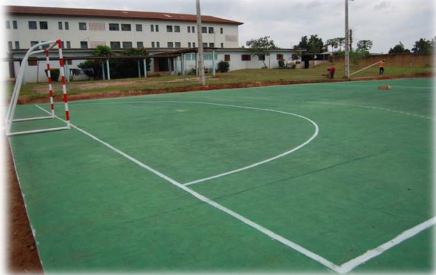
Sports field - University campus (Daloa)