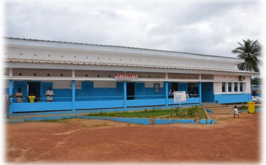
Maternity (Dabou )