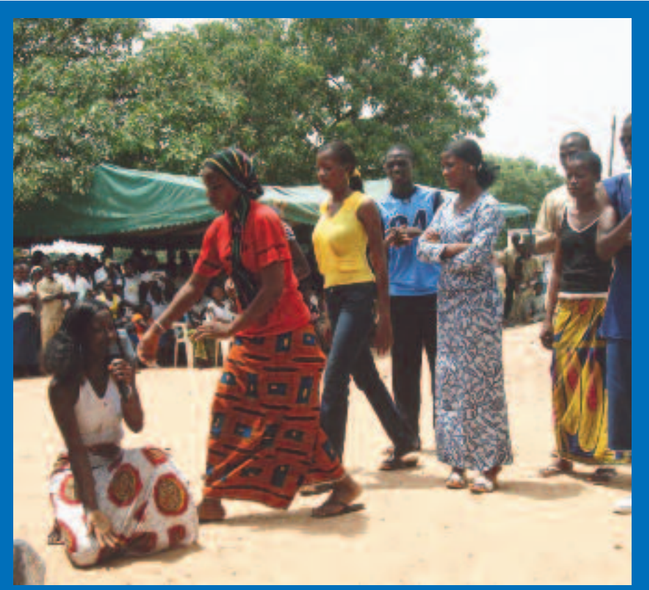
Youths in Ferkessedougou try to educate the population through sketches on World Environment Day

he World Environment Day was celebrated by the United Nations Development Programme (UNDP) in collaboration with the United Nations Operation in Côte d'Ivoire (UNOCI) on Monday 7 June 2010. The celebration was attended by more than 500 school children and teachers of the Lycée Moderne of Ferkessédougou, 620 km north of Abidjan.