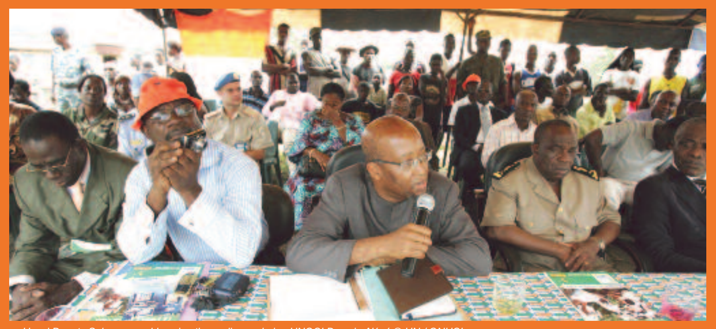
Unoci Deputy Spkesman addressing the audience during UNOCI Days in Alépé

etit Alepe, the divisional headquarters of Alepe division, located some 50 km. East of Abidjan, hosted the 9th edition of UNOCI Days, an information and sensitization programme of the United Nations Operation in Côte d'Ivoire (UNOCI), from 9 - 11 June 2010.