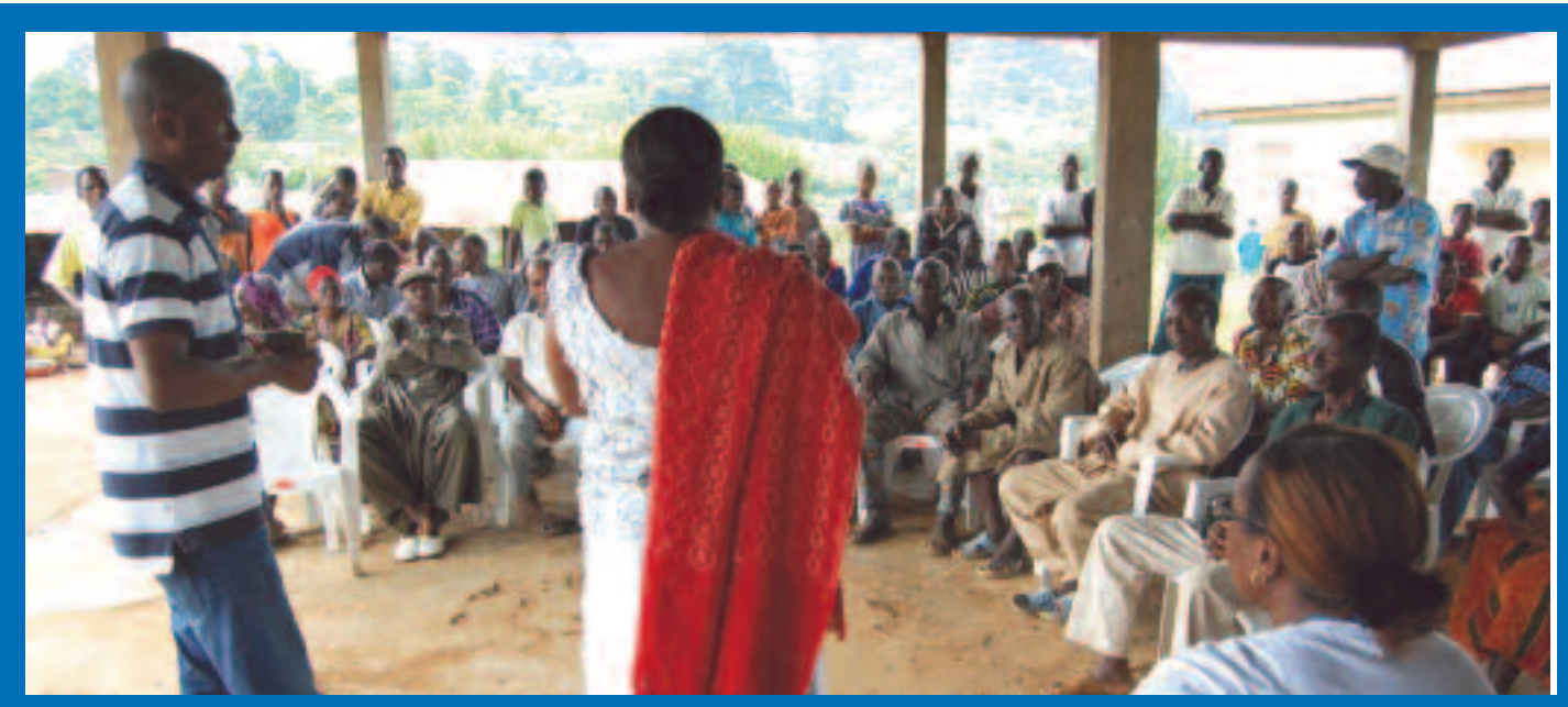
People in Biankouma during a sensibilisation session against gender-based violence © UN / ONUCI

he Mountain region in the west of ôte d'Ivoire is a zone where people have practised female genital mutila-tion for generations. With the crisis that Côte d'Ivoire has been going through since 2002, all forms of abuse against women continued in the region despite the efforts of local and international organizations which have been recent years to end such practices.