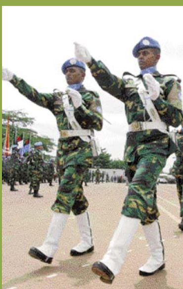
Bangladeshi soldiers on parade

The contingent's Level 1 hospitals in Man, Daloa and Zuenoula remain busy all year round providing free medical treatment to thousands of local people. BANBATT medical personnel also regu-