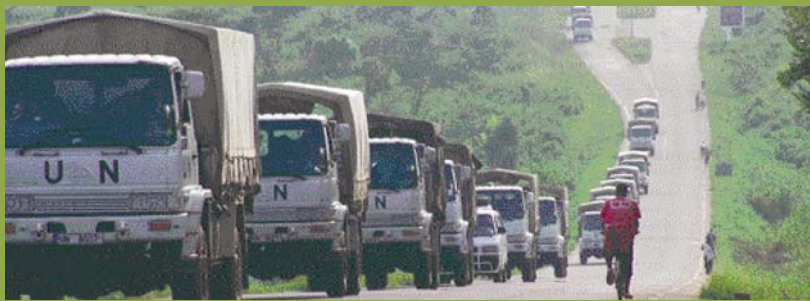
A convoy of Paktransport trucks

1 00,000 km every week, 40 trucks, 12 tanks, 4 tow trucks, 2 buses, 2 ambulances and 200 men dedicated to one important task : transporting goods and materials for the United Nations Operation in Cote d'Ivoire (UNOCI). Seven days a week these are the statistics of the transport unit of the Pakistan contingent known as PAK-