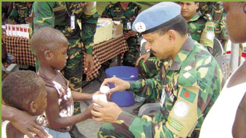
...is an important part of BANBATT peacekeepers' activities

By this time, the sun was setting and the day was coming to an end. So we said our goodbyes and headed back to our camp with a deep feeling of satisfaction.