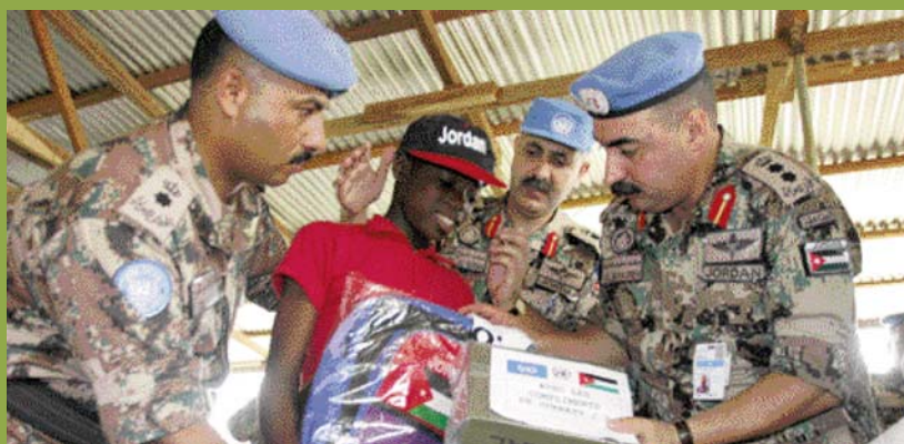
Jordanian soldiers offering school supplies to an Ivorian pupil

They were responsible for running the UN hospitals in countries like Sierra Leone and Eritrea.