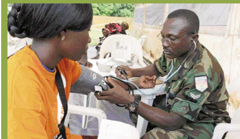
A GHANBATT medical staff checking a patient's blood pressure

The Ghana Medical Unit in Bouaké runs a Level II Hospital in Sector East, which provides medical care for all military and civilian personnel within the Sector. Since its inception, the hospital has