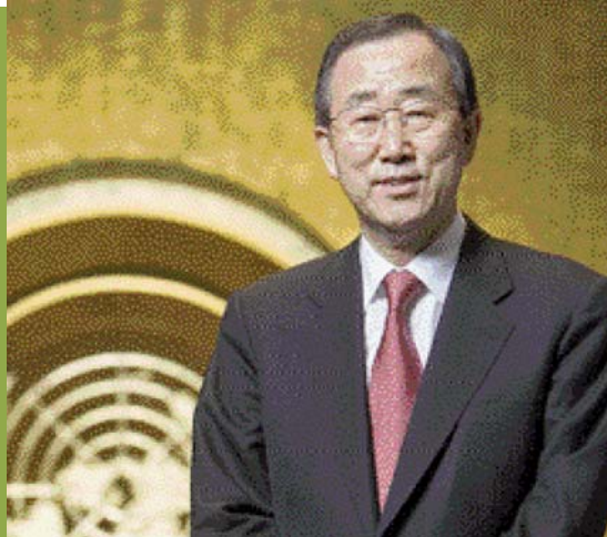
UN Secretary-General Ban Ki-moon

T his year, the annual International Day of United Nations Peacekeepers also marks the sixtieth anniversary of United Nations peacekeeping. Six decades ago today, the Security Council established our first peacekeeping mission.