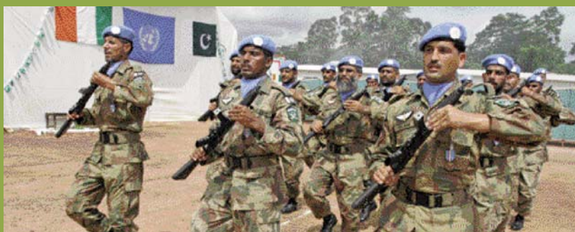
Pakistani soldiers display their weapon skills

In addition to its peacekeeping duties, PAKBATT also carries out a number of humanitarian actions to the benefit of the Ivorian population, including providing cooked meals on a daily basis for a group of handicapped people working in a local centre in Bouaké as well as free medical treatment and medicines to the sick.