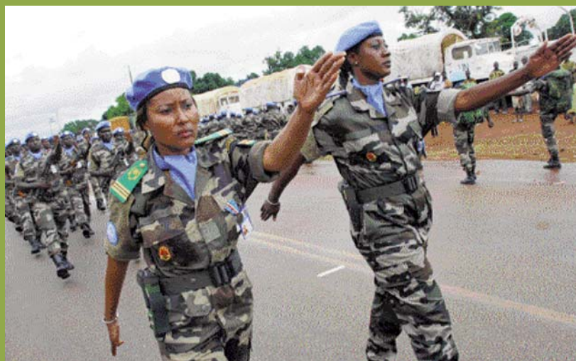
Nigerien soldiers on parade

The troops' medical personnel also provide free medical help to the local population and regularly distribute potable water in Korhogo and Ferkesse-