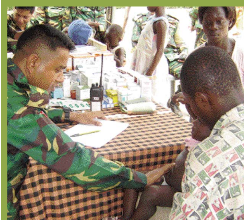
Humanitarian action ...

Their illnesses varied from stomach aches to quite serious cases of malaria. The BANBATT doctors worked carefully diagnosing illnesses, giving advice on nutrition and hygiene and handing out