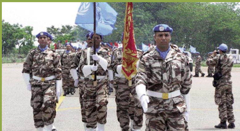
Moroccan soldiers on parade

Their civil-military action consists of the distribution of food, potable water and medicines to those in need.