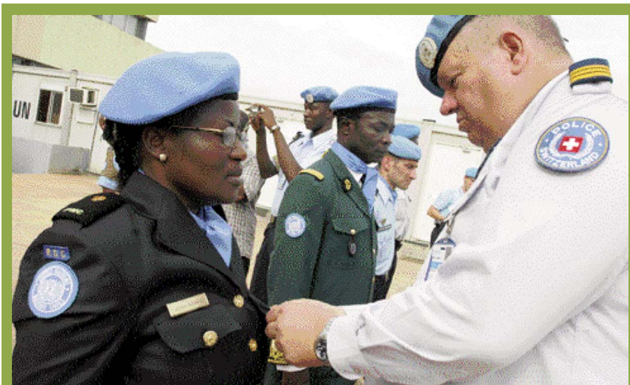
Colonel Pierre Andre Campiche, acting Commissioner of UNPOL presents the UN Medal to UNOCI police officers in recognition of their dedication to serving Ivorians

T he mandate of the UN Police (UNPOL), deployed in Côte d'Ivoire under Security Council Resolution 1528, includes contributing to the security of the Ivorian territory, providing training for police officers and gendarmes, and supporting the reform of the National Police and Gendarmerie.